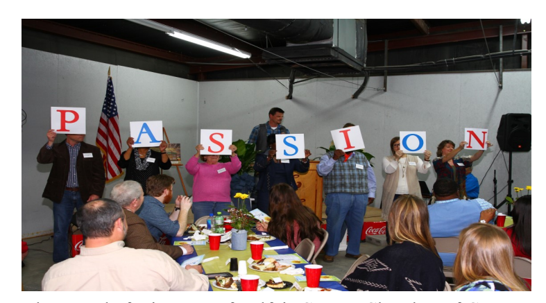
The Board of Directors of Telfair County Chamber of Commerce

P ossible believe that anything is Attitude with the right Successful and this county can be Serve and they are willing to